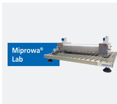
LAB Scale 0,6 – 15 L/h