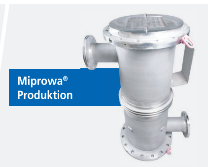
PRODUCTION Scale bis 10 m 3 /h