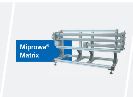
PILOT Scale 2 – 150 L/h